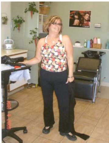
Change in Progress

My experience at New Image Bariatric was so amazing. The staff was so educational. The Support Group meetings are fun and have changed my outlook on obese people. I have made friends and found a common bond and alliance with other members going through the same life changing journey.