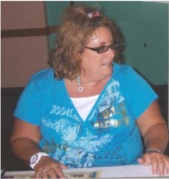
At my heaviest

"My journey through life as an obese person, at the heaviest, 232 pounds, was a painful time.