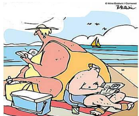
Sunblock, for insensitive skin.